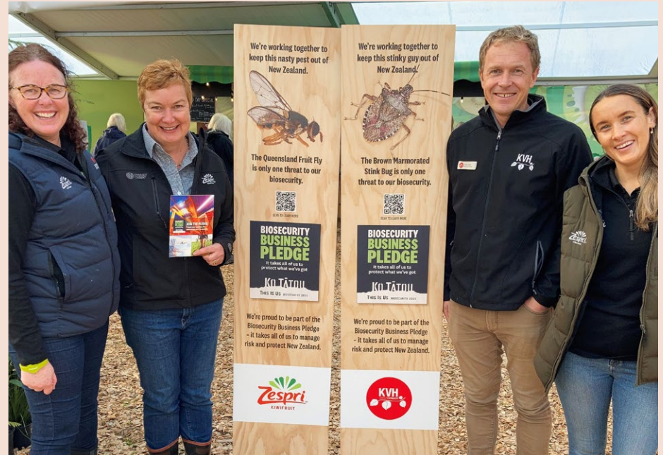
Members proudly promoting biosecurity at National Fieldays, Mystery Creek

Consistent member feedback has been that significant value is being delivered through the partnership with Biosecurity New Zealand, and the way the Pledge works as a platform for open collaboration, information, and lesson sharing.